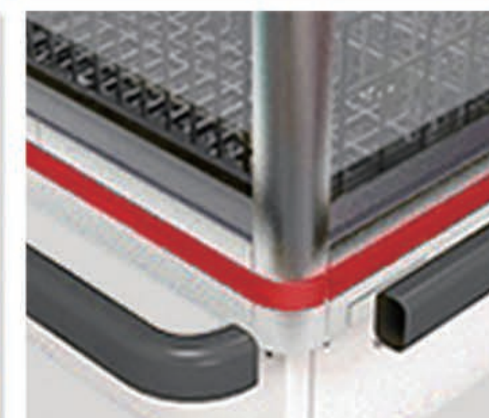
Composites and Plastics Processing